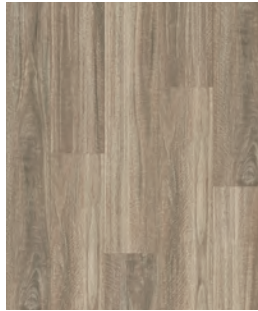
Seaside Spotted Gum